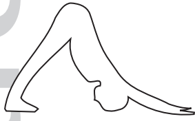
Adho Mukha Svanasana